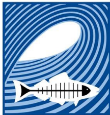
Heal the Bay Surfrider Club