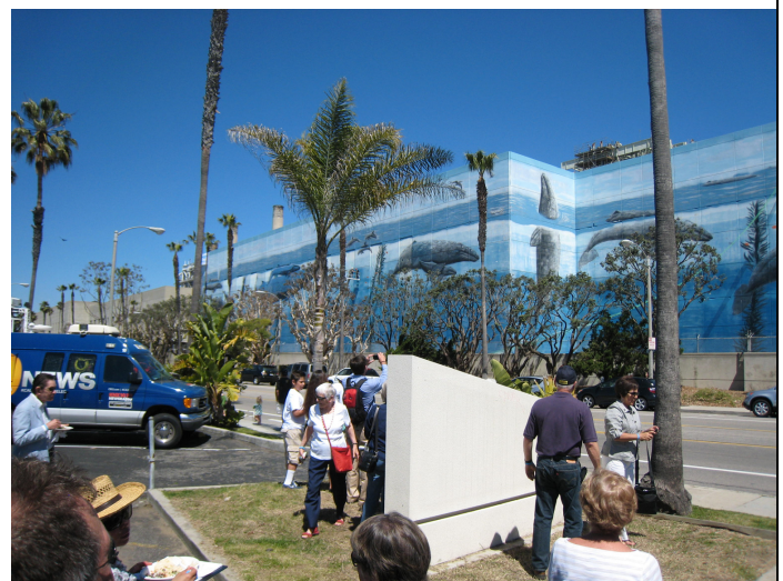
Wyland whale mural on AES building in Redondo Beach