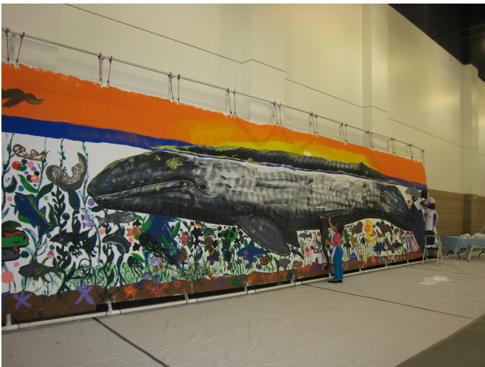
Wyland whale painting completed with children from science fair